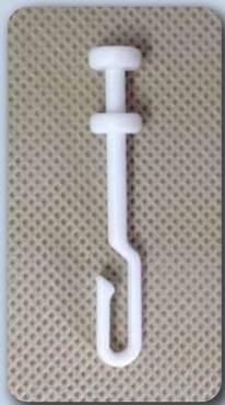
Removable quick fit hook