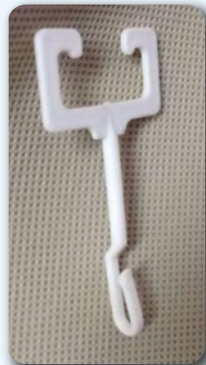
Removable U hook