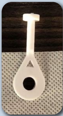
Fixed stem hook